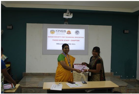
Principal gives away Resource Person Award

The ISTE Staff Chapter, Kings College of Engineering, organized a Prize distribution function on 14.03.2024 between 4.00pm and 4.30pm. The Principal distributes the awards to the resource persons of various seminars and winners of various competitions which are conducted by this chapter in the academic year 2023-24(Odd Semester). The Principal appreciates the Coordinator of the chapter, Resource Persons and Prize Winners.