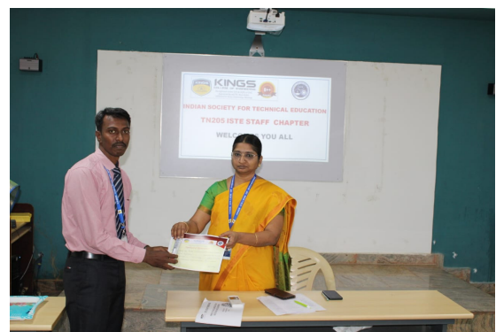
Principal gives away Prize Winners Award